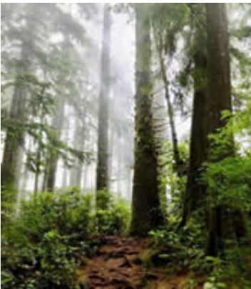
Caroline BATTERY BFA, DVATI